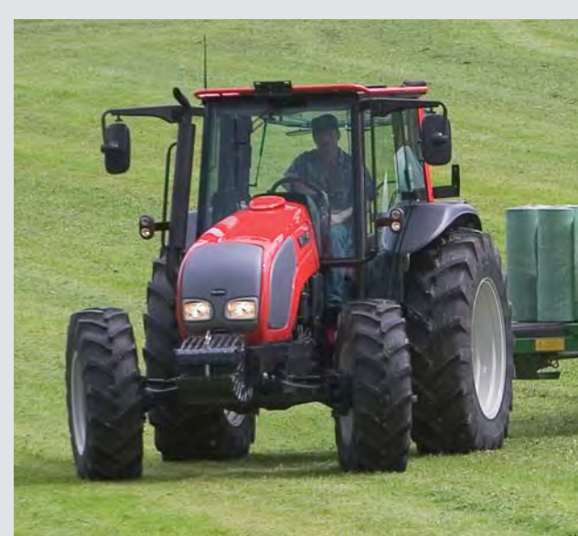
Valtra A Series low cab model.

The A72 is the most affordable way to enter the world of Valtra's Scandinavian tractors. Like all other Valtra tractors, the A72 is ideal for working efficiently in fields and forests throughout the year.