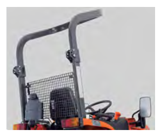
Rear Mounted ROPS/Malfunction Prevention Screen

Standard on all of the new B1 Series models, this screen protects the driver from performing potentially dangerous tasks.